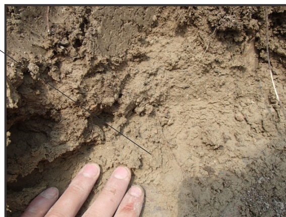
Figure 44: Quaternary stratigraphy present at section 112-16-350. Till sample numbers are in white boxes. Munsell colour from Munsell Colour–X-Rite, Incorporated (2015).